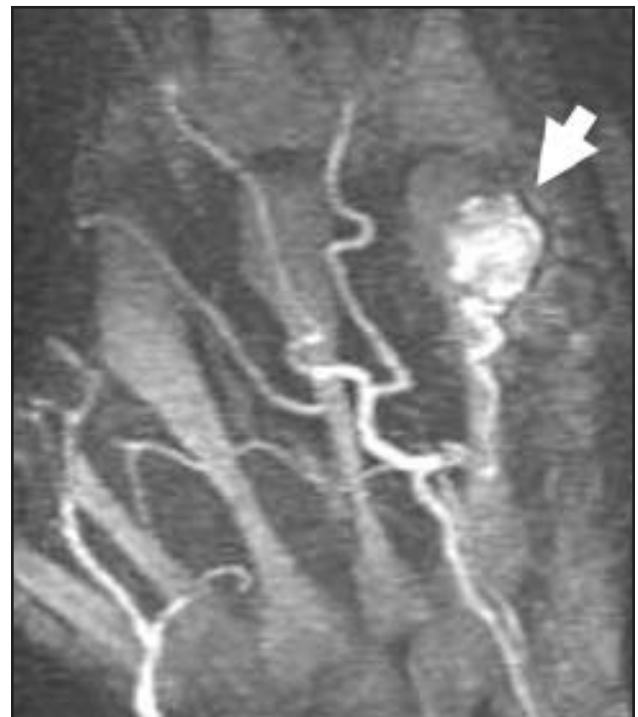
Fig 5. — Anteroposterior MRA of the hand obtained from a 3-dimensional data set shows a small vascular spindle cell hemangioma (arrow), with vascular supply from the ulnar artery.

Recent advances in both hardware and software imaging technology have provided marked improvement in vascu-