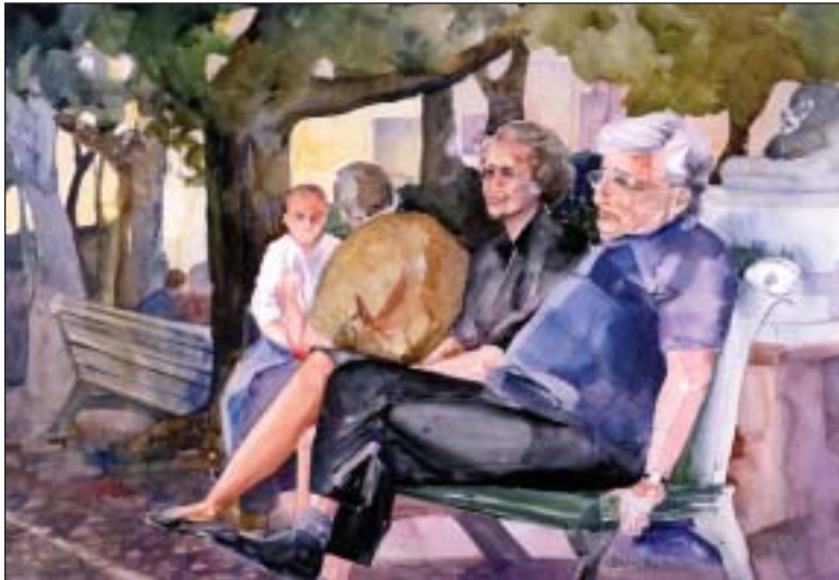
Dorothy Fox. Mt. Porzio Couple . Watercolor, 28" × 36".

Advances in imaging techniques have markedly improved the diagnostic efficacy of evaluating soft tissue masses.