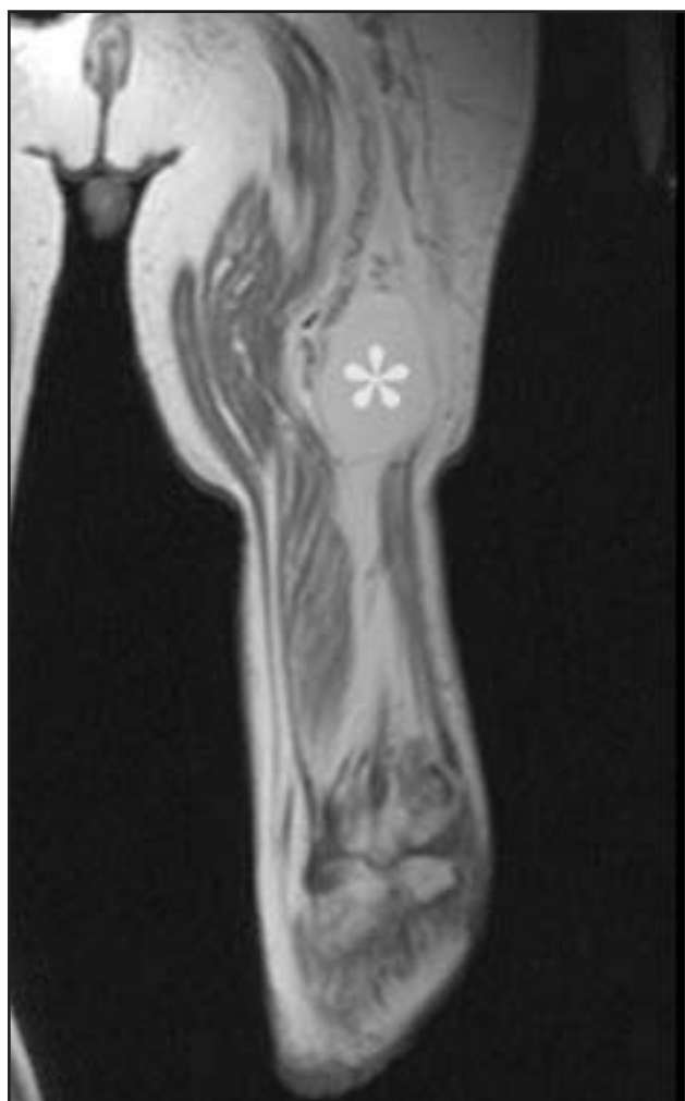
Fig 2. — Coronal T1-weighted sequence, benign lipoma (asterisk) of the thigh. The diagnosis of lipoma is made when the lesion shows a signal identical to that of subcutaneous fat on all imaging sequences.

Image quality has been markedly improved due to the introduction of multidetector scanners and high-quality multiplanar reformatted images. Multidetector scanners allow acquisition of 2, 4, 8, or even 16 images during each tube rotation. Faster gantry rotation speed (up to 0.5 seconds per rotation) allows more volume coverage with better detail. The combination of faster gantry speeds with multidetector technology results in up to 8 times faster