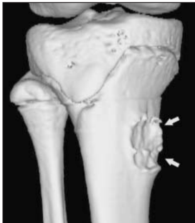
Fig 3. — Reformatted 3-dimensional CT image of the proximal tibia shows osseous remodeling (arrows) from juxtacortical cartilage tumor.

PET has proven to be the “gold standard” in metabolic imaging. PET utilizes radioisotopes that undergo positron emission decay. A sophisticated ring detector surrounding the patient then detects the paired gamma photons released as a consequence of decay and registers the interaction in the form of an image. The radionuclide most commonly utilized for PET is [ 18 F]-fluoro-2-deoxy-D-glu-