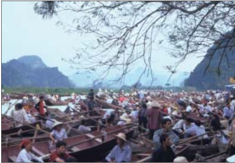
Pilgrims at the time of the lunar festival, Perfume Pagoda outside Hanoi, Vietnam.

New developments in molecular-based treatments might improve the prognosis for patients with brain tumors.