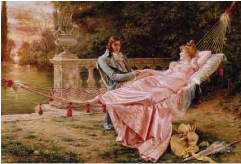
Charles Joseph Frederic Soulacroix, 1825-1879. Betrothed. Oil on canvas, 24 7/8" × 33".

Head and neck melanoma should be treated aggressively when morbidity is not significantly increased.