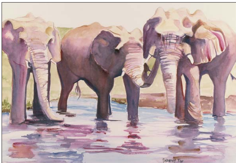
Dorothy Fox. Elephants . Watercolor, 22" × 30".

Studies focusing on the medical and psychosocial needs of adolescent and young adult cancer survivors are needed to address their specific needs and challenges.