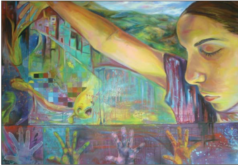
Sofia Cáceres. El Sueño Profundo I (The Deep Dream I) . Oil on table, 48" × 96".

Aggressive surgical resection of pancreatic neuroendocrine tumors may improve symptomatic disease and overall survival in selected patients.