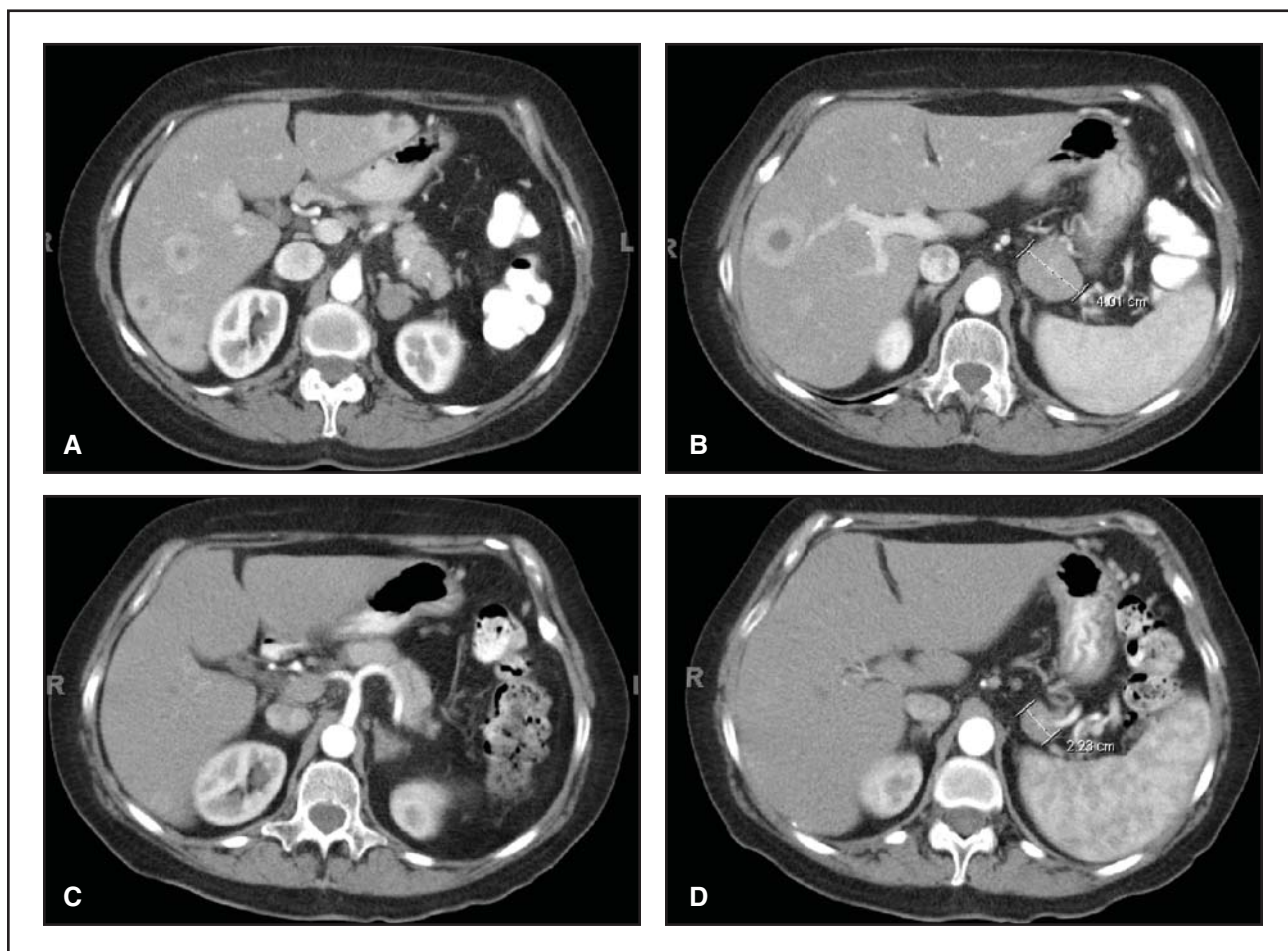
Fig 2. — Response to neoadjuvant chemotherapy. A 62-year-old woman with nonfunctioning pancreatic endocrine carcinoma and bilobar liver metastases (A-B) received preoperative chemotherapy with (C-D) significant response at all sites. She subsequently had resection of the primary tumor as well as combinational treatment of resection and radiofrequency ablation of her liver metastases with 100% eradication of her disease. She is alive and well 6 months postoperatively without recurrence.

Currently, a bias exists for aggressive surgical therapy for advanced well-differentiated PNETs; however, a recent report from Sørbye et al 51 suggests that advanced poorly differentiated PNETs responsive to chemotherapy should also be considered. They report a 5-year survivor with poorly-differentiated carcinoma that responded to neoadjuvant cisplatin and etoposide who underwent complete surgical resection of the primary and liver metastases.