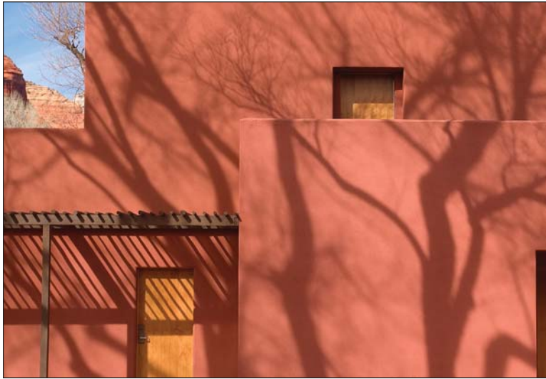
Sedona Courtyard_2331.

Several new classes and combinations of agents are improving the outlook for patients with MDS.