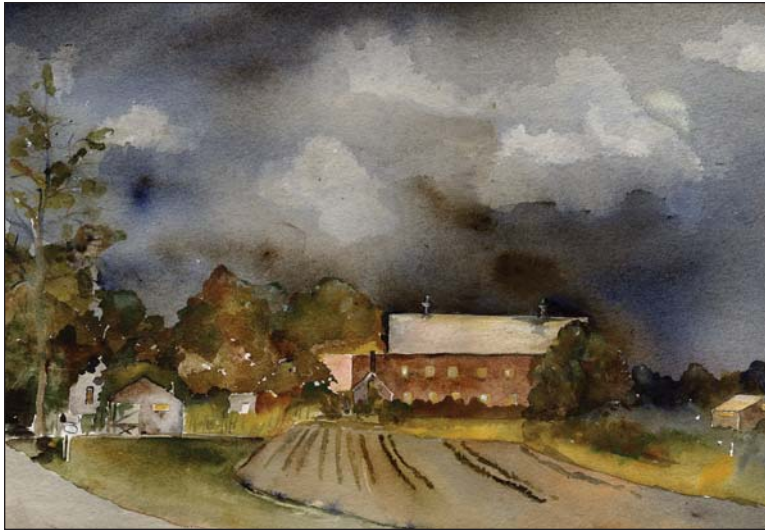
Marguerite Bride. Country Farm II . Watercolor, 10" × 15".

Systemic treatments for patients with metastatic endometrial cancer are reviewed.