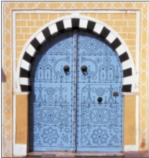
Sidi Bou Said, Tunisia, 1999.

A normal transitional cell acquires the malignant phenotype due to the interaction of tumor suppressor genes, oncogenes, growth factors, adhesion molecules, and angiogenic factors.