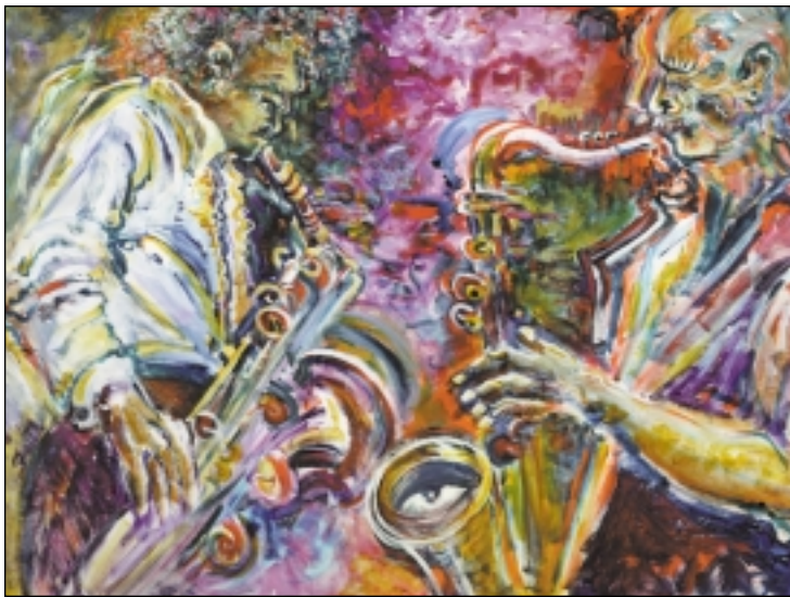
Faith Krucina. Spirit of the Mentor . Acrylic on canvas, 48" × 36".

The efficacy of neoadjuvant androgen ablation in reducing prostate tumor bulk prior to definitive local therapy is being investigated