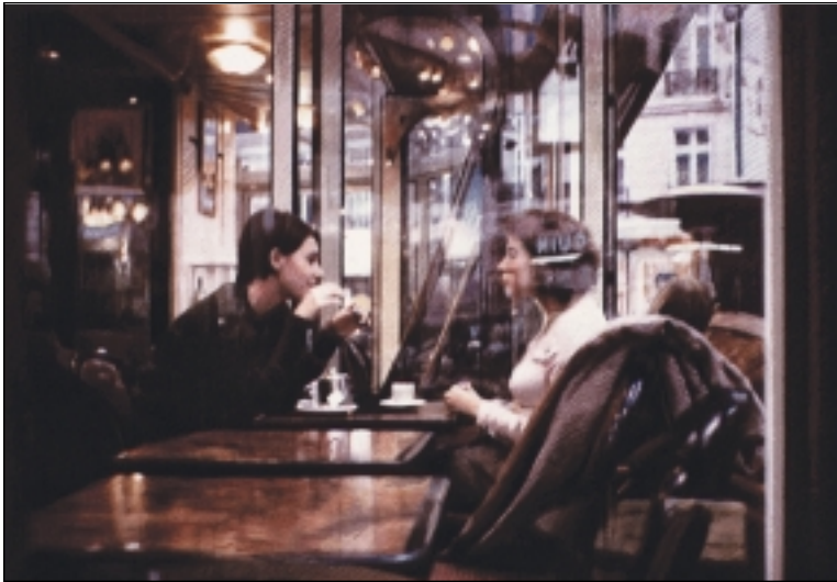
Adrian Deckbar. Café Interior . Pastel over giclée, 27" × 40".

Use of the sentinel lymph node procedure probably eliminates occurrence of the postmastectomy pain syndrome.