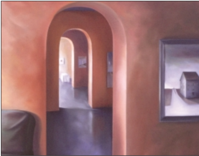
Tina Sotis. The Hitchhiker ©2001. Oil on canvas, 24" × 30".

Chemotherapy in hormone-refractory prostate cancer can decrease PSA levels and improve quality of life.