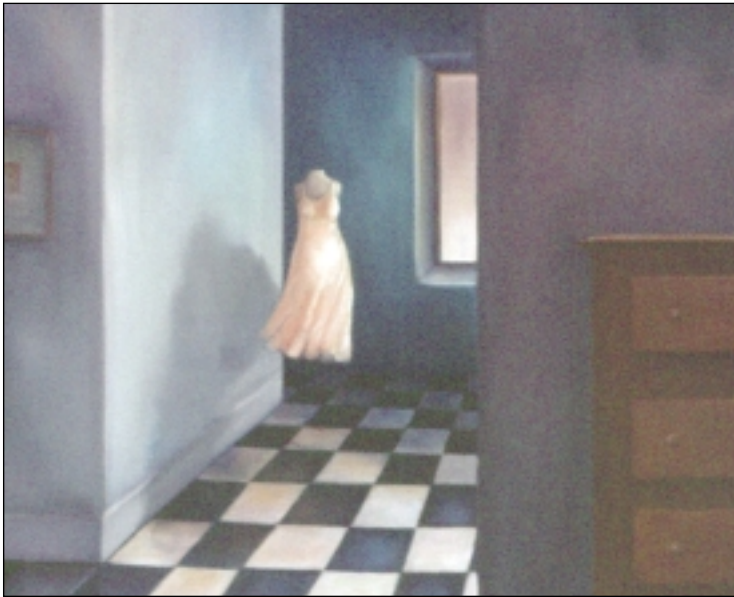
Tina Sotis. Napoleon and Josephine ©2000. Oil on canvas, 18" × 18".

Urinary incontinence is a common adverse effect of therapy for localized prostate cancer but can be treated effectively.