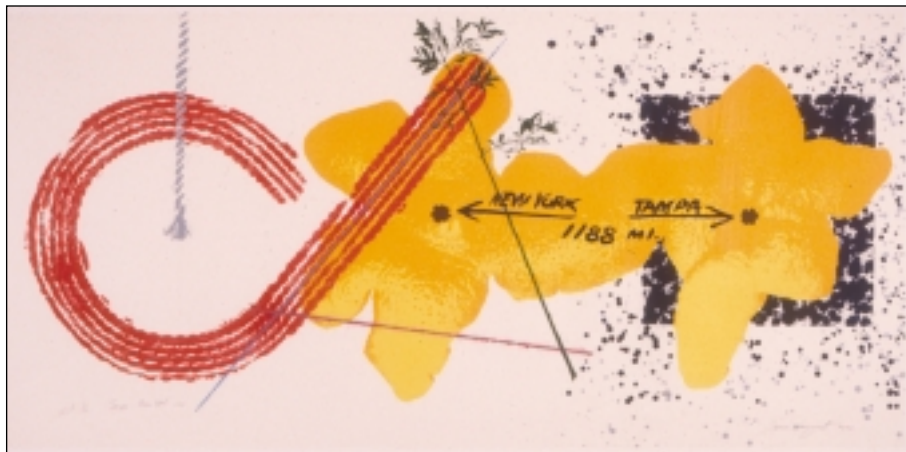
James Rosenquist. Tampa-New York 1188 , 1975. Lithograph, 36" × 74".

Trastuzumab can be beneficial when used alone or with cytotoxic antitumor agents in selected patients with breast cancer.