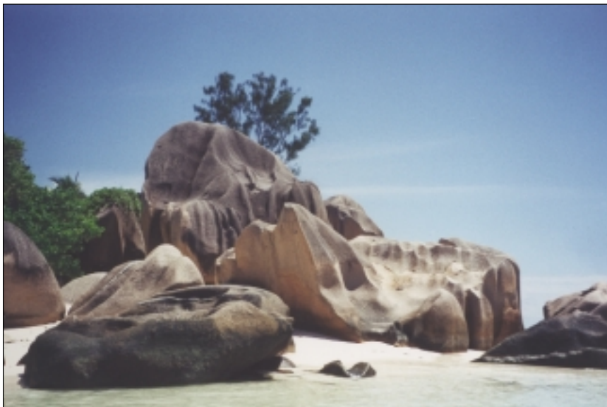
Michele Sassi. La Digue Island, c. 2001. Seychelles Islands, Indian Ocean. Photograph.

Several strategies have been used to inhibit VEGF, including anti-VEGF monoclonal antibodies and agents that inhibit the VEGF receptor.