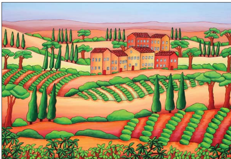
Kala Pohl. Let's Stick Together . Acrylic on canvas, 24" × 30".

The prognostic factors, potential biomarkers, surgical strategies, and adjuvant therapy trials for patients with locally advanced renal cell carcinoma are reviewed.